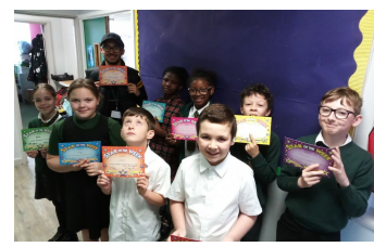
Plus the whole of 4 Cedar

Reminder for Breakfast Club - Starts at 7.40am. Please do not arrive before this time.