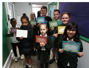
Plus the whole of 6 Pine